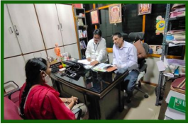
Article Placement @ Gudiwada