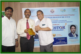
Investor Awareness & Ugadi Panchangam