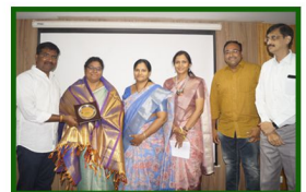
Young Members Meeting