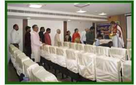
Oneday Workshop on Annual Closure